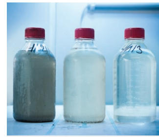
Cleaning results: left – untreated, centre – with HydroM.E.S.I. Particle Separator type STATIC, right – with additional filtration

surface and fall downwards to the water and particulate mixture to the bottom of the tank structure. The geometrical design of the separator provides a large settling surface which reduces the treatment system's load significantly whilst at the same time boosting its performance.