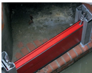
Damming an emergency overflow

The HydroBeam® sealing system's performance is well below the leaking limits allowed by DIN 19569-4. Retrofits for attaching the guide frames can be supplied depending on the project. Cost-effective stop-logs / beams can be applied for a range of water heights.